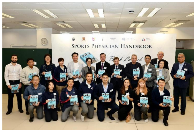
Photo 1 - Group Photo of officiating guests and Hong Kong contributors

Officiating Guests: (Full list in the appendix)